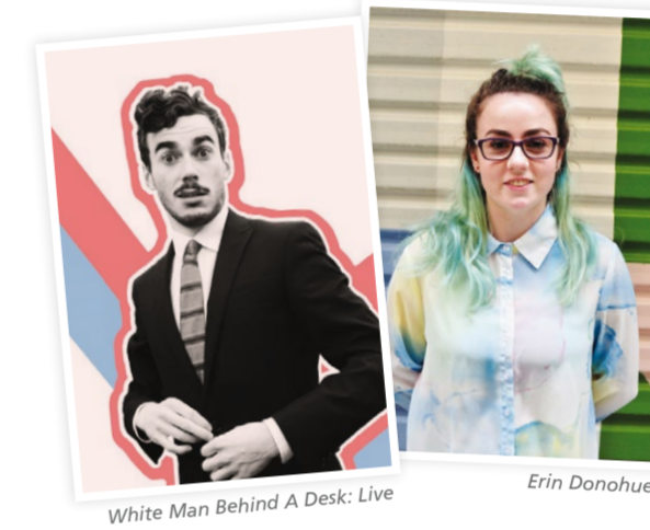
White Man Behind A Desk: Live