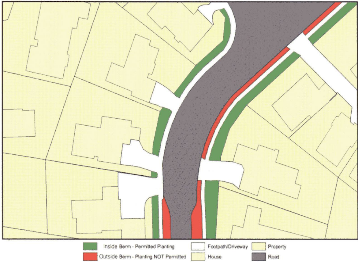
Map showing planting allowed areas of berm