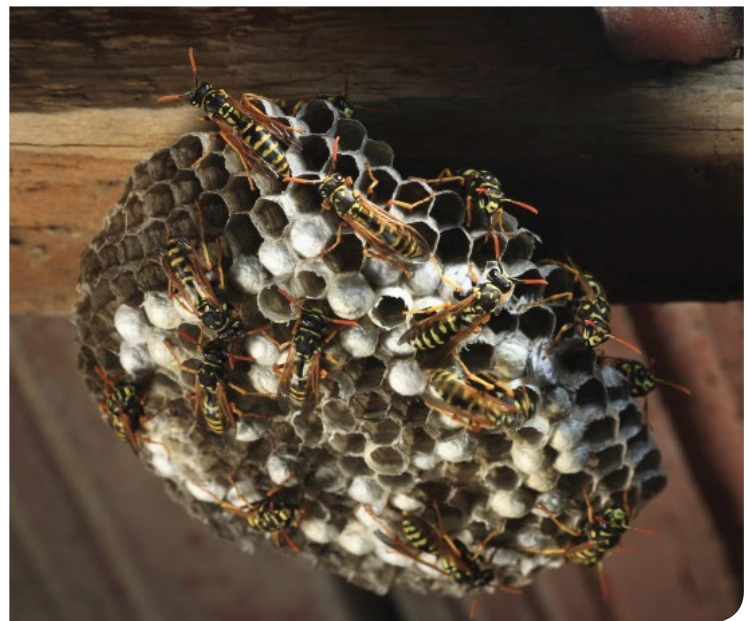
European paper wasp nest in roof space.

Contact MPI's free 24-hour pest and disease hotline 0800 80 99 66