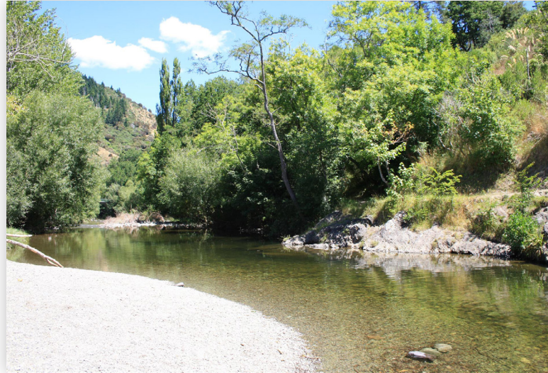
Maitai swimming hole in Branford Park.

A health warning remains in place for the lower Maitai below Collingwood Street Bridge and for the Wakapuaka River at Paremata Flats Reserve warning people not to swim at these sites.