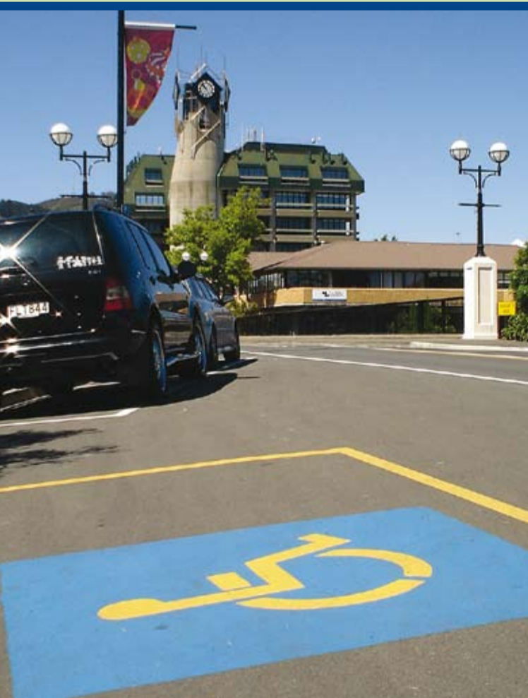
A guide to mobility carparks and accessible facilities around Nelson 2013